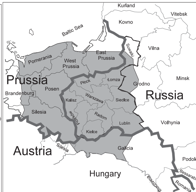
Congress Poland or Kingdom of Poland was part of the Russian Empire, west of the dotted line, 1815-1921